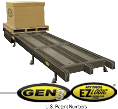
U.S. Patent Numbers 5,862,907 • 7,243,781 • 7,591,366 Other Patents Pending.