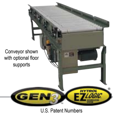
U.S. Patent Numbers 5,862,907 • 7,243,781 • 7,591,366 Other Patents Pending.

Overall length must be divisible by zone length