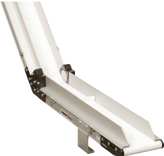
Horizontal to Incline