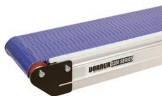
Micropitch Closed Mesh