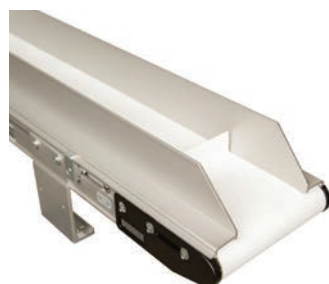
Cleated LPZ Aluminum Side Guiding