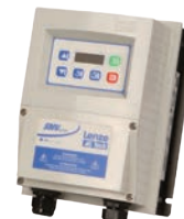
Full Feature VFD