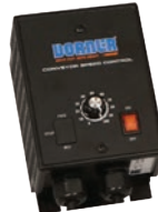
Basic VFD Control