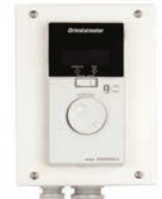
Brushless DC Control