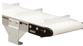
Flat Belt Cleated